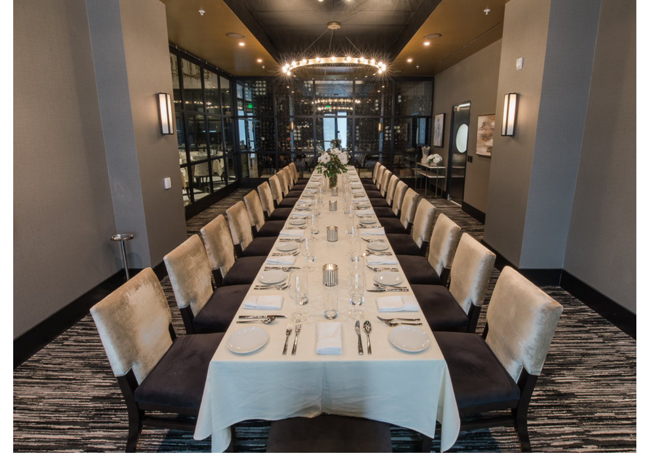
▲ PDR | WINE ROOM ▼